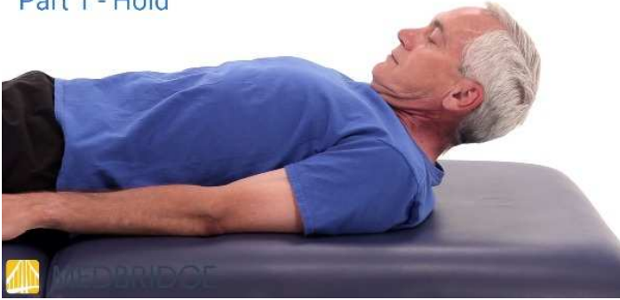
ACTIVITY: PART 1 - HOLD HEAD RAISE UP TO 1 MINUTE