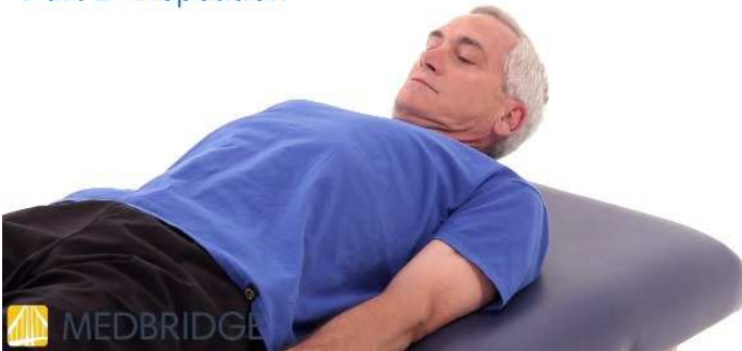
ACTIVITY: PART 2 - PERFORM 30 HEAD RAISES